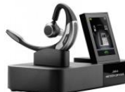
Wireless & Corded Headsets